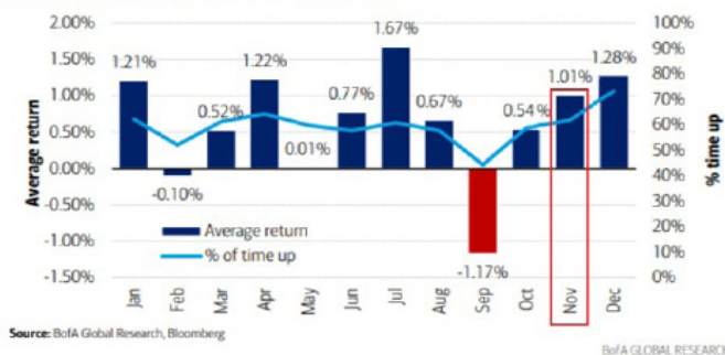
Exhibit 2: In November, the S&P500 rose 59% of the time by an average +1.01% S&P 500 average monthly returns and up ratio since 1927

Finally as we enter the final two months stretch of the year, we gaze into 2026 with increased optimism. As we discussed throughout the year, the stars are aligning for another strong year of returns as the US economy benefits from the Trump policies implemented this year. These include, Tax cuts and Tariff revenues which will bring back significant investment into the US. Reduced regulations to accelerate investment. Lower interest rates and inflation which benefits consumer spending. And finally the backdrop of potentially one of the biggest technology revolutions of our lifetime - the AI thematic.