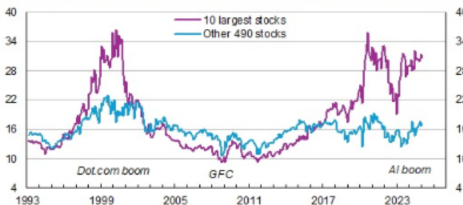
Figure 4: S&P500, PE ratios, 10 largest stocks and the other 490 constituents*