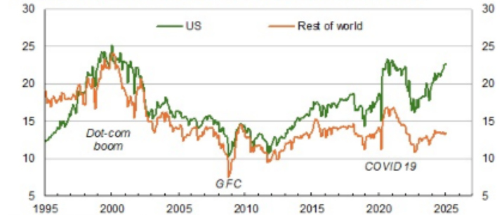
Figure 5: International equities, PE ratios, US and other markets*